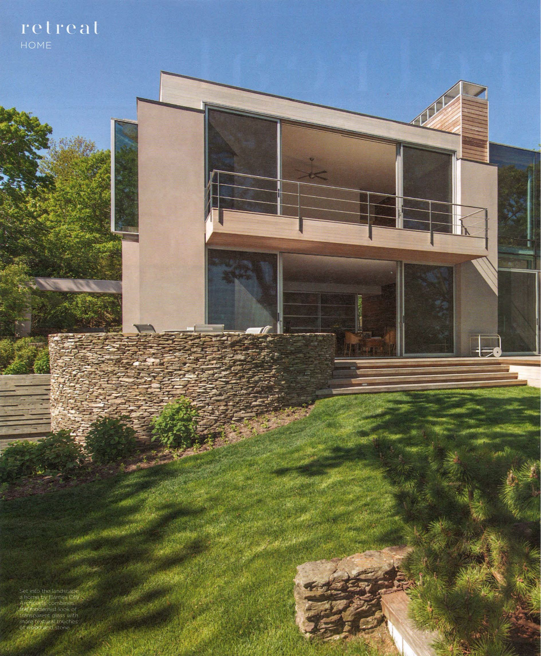
Set into the landscape, a home by Barnes Coy Architects combines the modernist look of transparent glass with more textural touches of wood and stone.