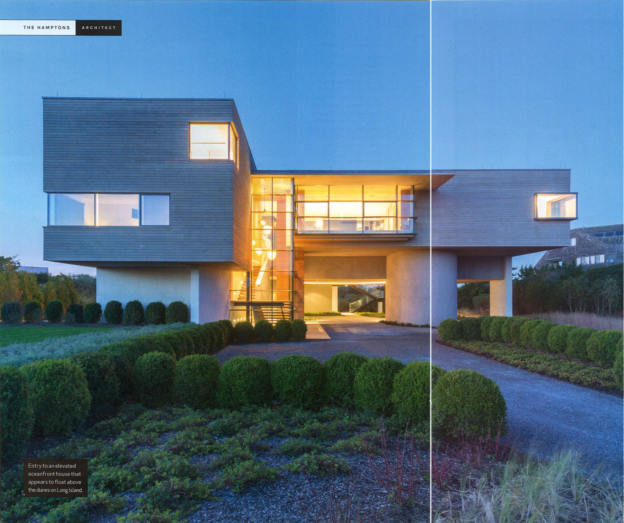
Entry to an elevated oceanfront house that appears to float above the dunes on Long Island.